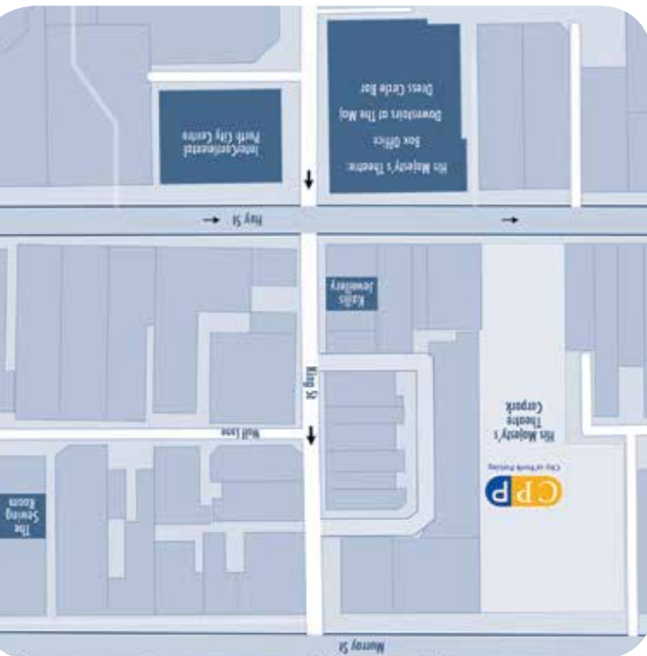
King St Festival Map

825 Hay St, Perth WA 6000 His Majesty's Theatre Downstairs at The Maj Dress Circle Bar 29 King St, Perth WA 6000 Kailis Jewellery 317 Murray Street, Perth WA 6000 The Sewing Room Basement, entry via Wolf Lane 815 Hay St, Perth WA 6000 InterContinental Perth City Centre